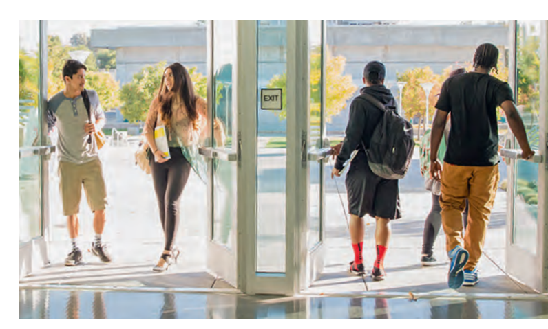
Los Medanos College students at the Student Services building entrance