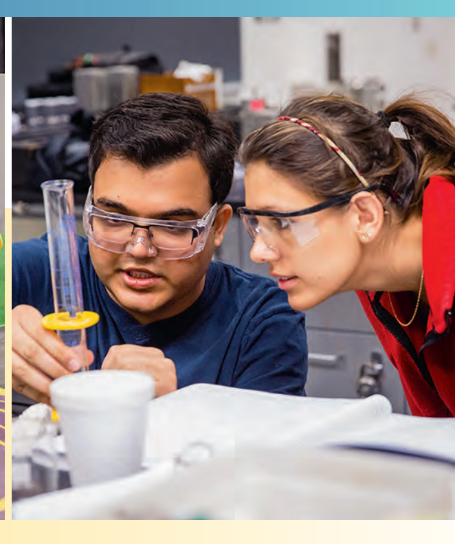
Students on Contra Costa Community College District campuses